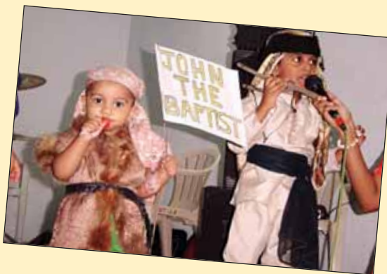
The forerunner. John the Baptist acknowledges Jesus, but in the modern way !