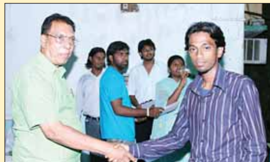
Students and teachers receive prizes / gifts from elders of the church