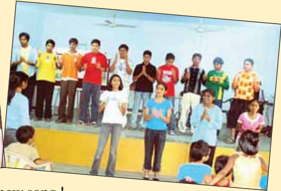
Sing ... a new song !