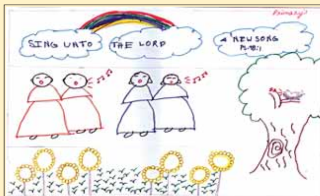
P. Nicole Primary - I Prize