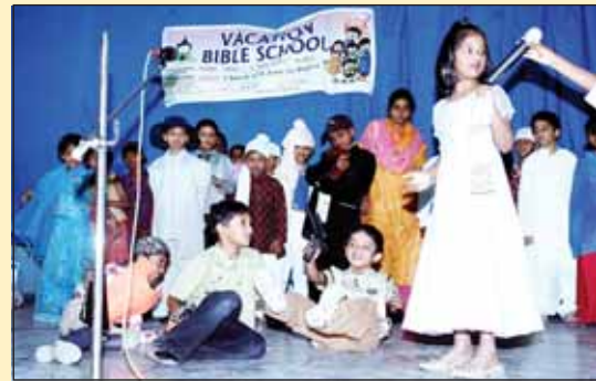
Lady with the Lamp