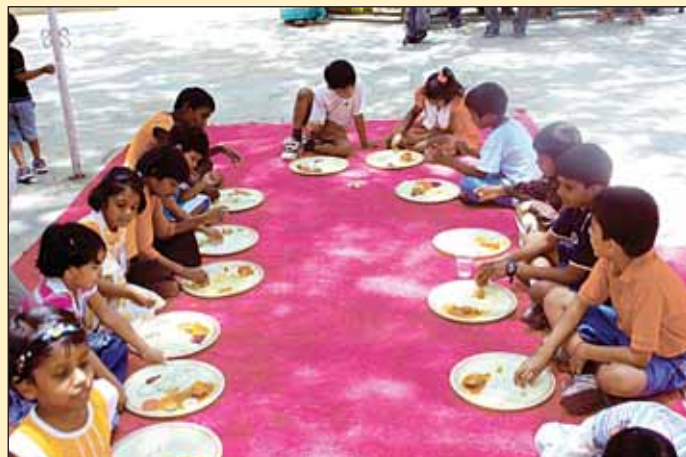
Children tasting the joy of 'Love Feast Fellowship'