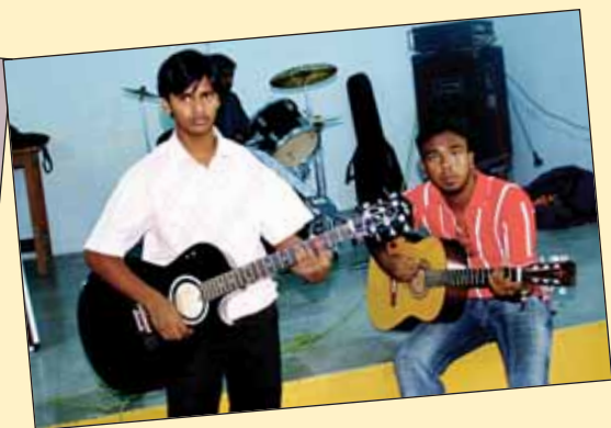
The sound of Music : Our young musicians called 'GLOW' can shine as stars