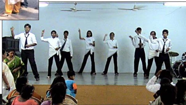
Rocking Performance: Seniors praising God in style