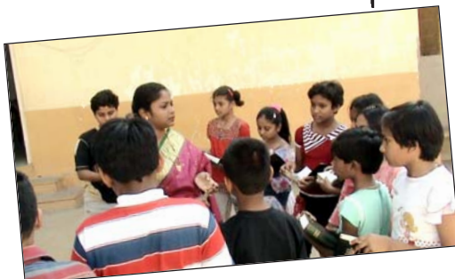
Yes Madam: A Sunday school class in progress