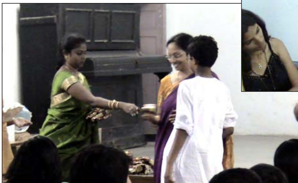
Recognising the Talent: Prize distribution in progress