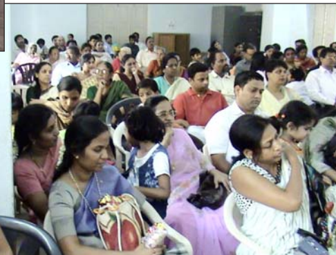
Chock-a-block: The jam-packed Parish Hall