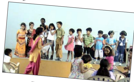
Twinkle, Twinkle little stars: The Beginners captivating the audience