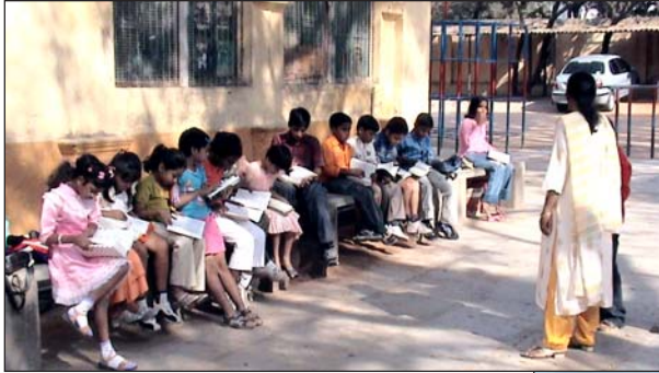
Silence Please: Bible exam in Progress