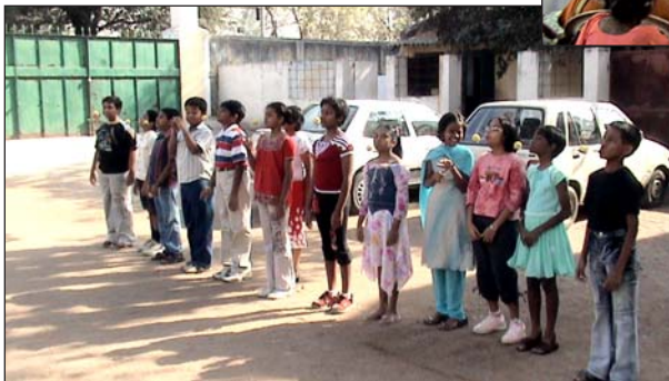
Get Set Go: The Lemon and spoon race on Sports Sunday