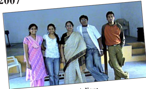
Bidding Adieu: The outgoing Senior Adults Class