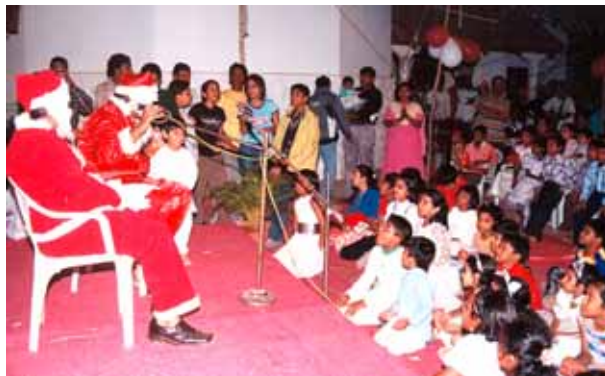
Santa Claus on reindeer ? Not in modern times. Children eagerly await gifts from a couple of Santas