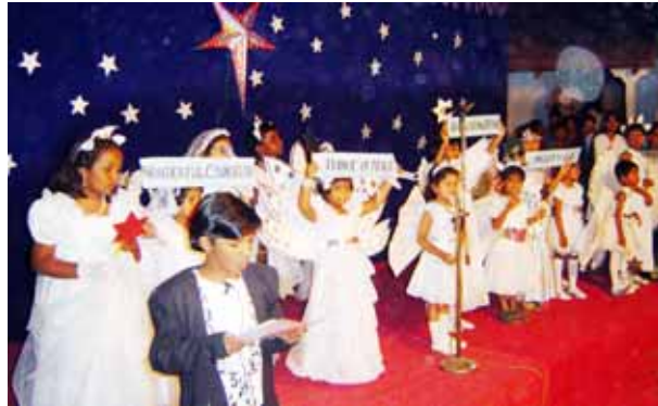
"Glory to God in the highest". Little angels of St. John's adding lustre to the pageant