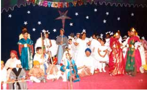
First Christmas. Children reenacting the momentous event