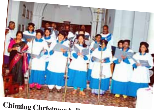
Chiming Christmas bells. The choir regaling the congregation with Christmas Carols