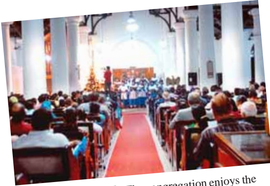
Sight beautiful. The congregation enjoys the special numbers presented by the choir