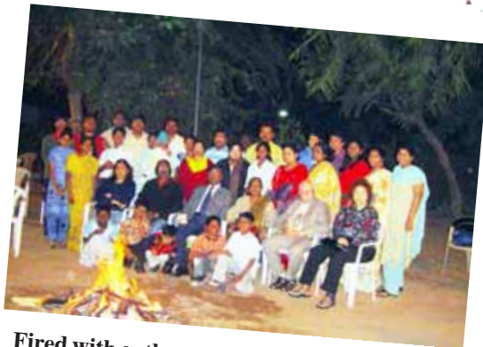
Fired with enthusiasm. Participants in the home visiting carol party enjoying camp fire