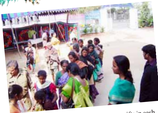
Remembering the poor. Christmas gifts in cash and kind for the needy